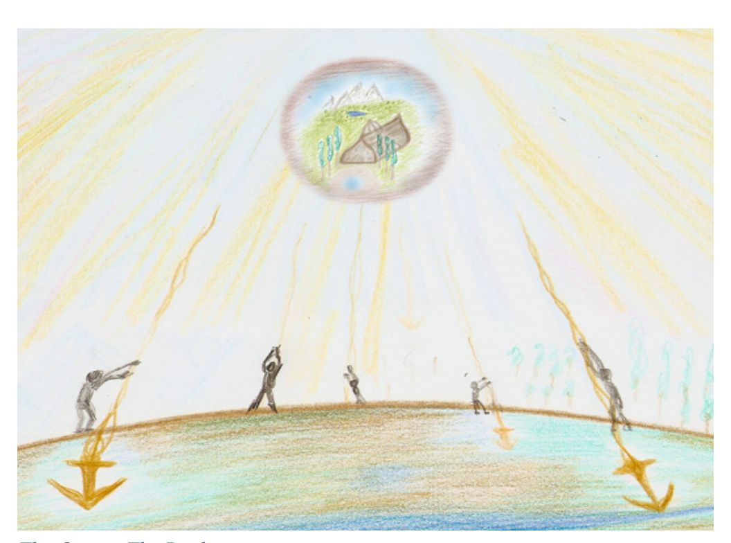
The Oasis - The Realization

This net contributes to the development of Earth towards a light and loving vibration that is harmonious with the Universe.