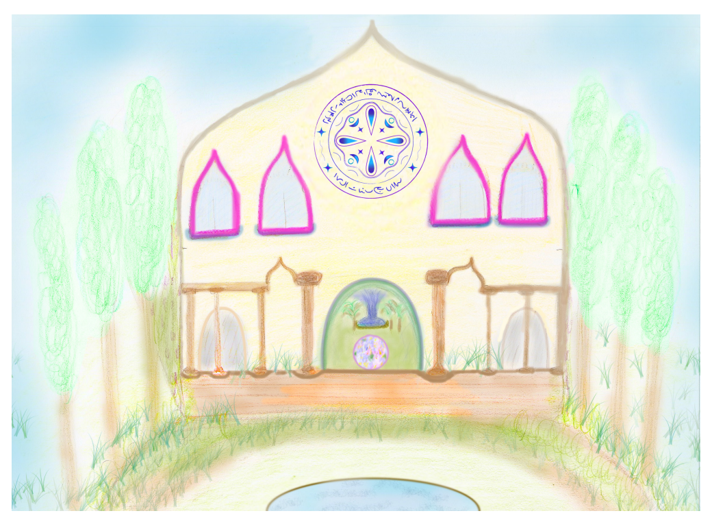
The Oasis - Main Building

The Oasis is built on an acupuncture point of the Earth's surface. Other places like this already exist, are being built right now, and with more to come in the future. All these places of peace, healing, and harmony are connected along the Earth's meridians. In this way, a powerful net of protection is built which also stabilizes the Earth while helping to raise its vibrations.